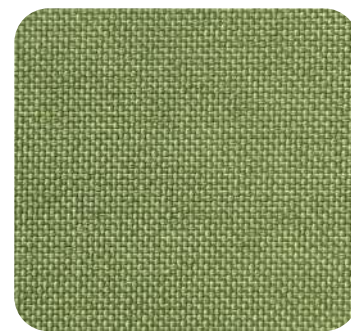
WEATHER DURABLE 50