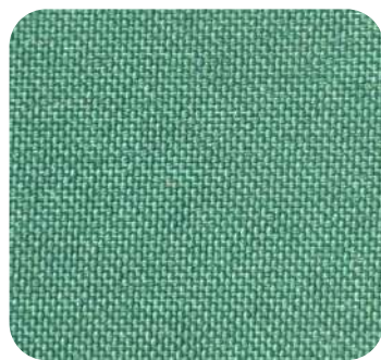
WEATHER DURABLE 39