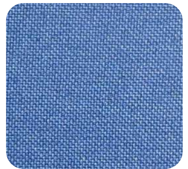
WEATHER DURABLE 19