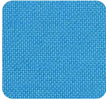
WEATHER DURABLE 51