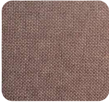
WEATHER DURABLE 29