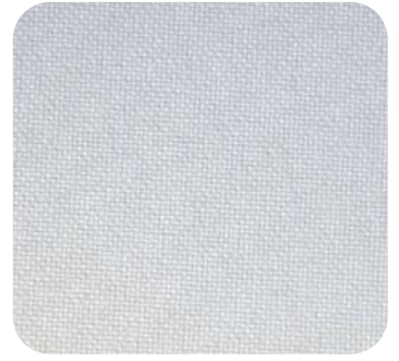
WEATHER DURABLE 00