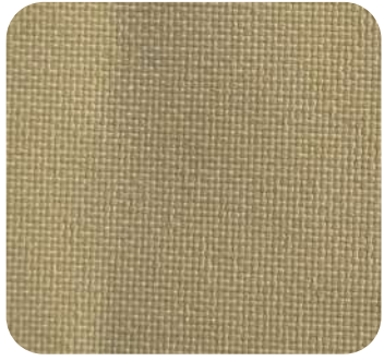
WEATHER DURABLE 09