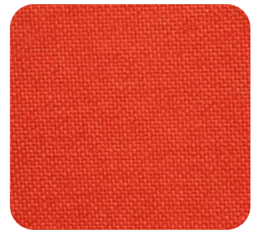
WEATHER DURABLE 17