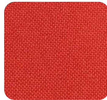
WEATHER DURABLE 63