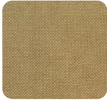
WEATHER DURABLE 30