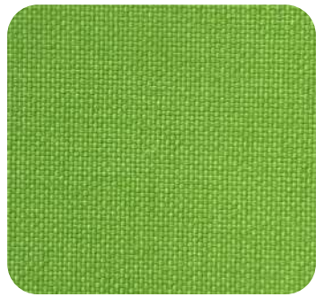
WEATHER DURABLE 26