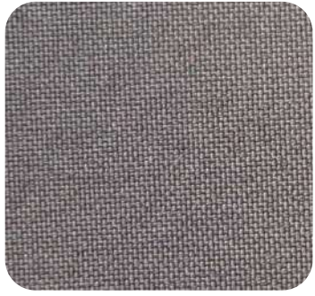
WEATHER DURABLE 31