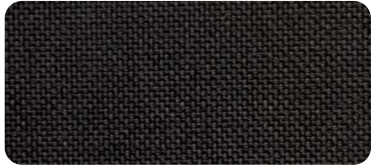
WEATHER DURABLE 10