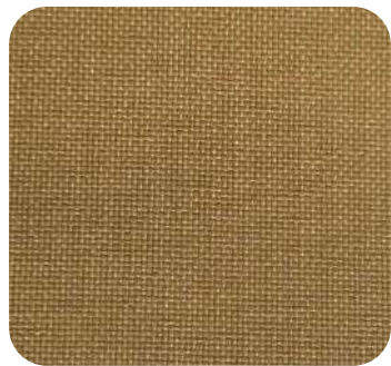
WEATHER DURABLE 08