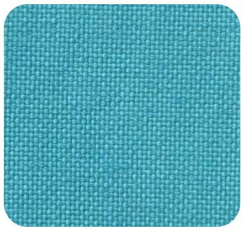
WEATHER DURABLE 36