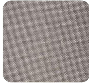
WEATHER DURABLE 38