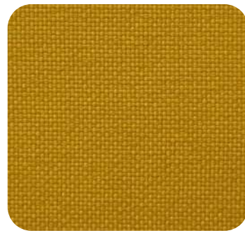
WEATHER DURABLE 34