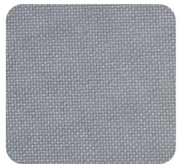
WEATHER DURABLE 32