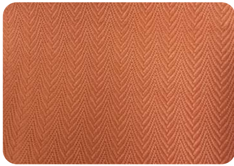
ALTO - 5025