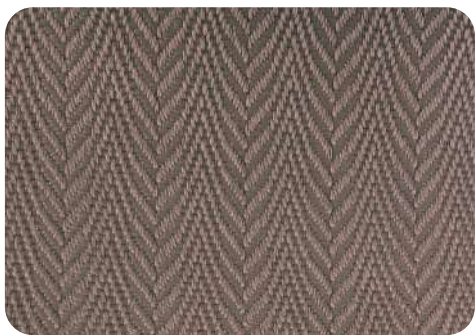
ALTO - 5118