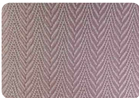
ALTO - 5102