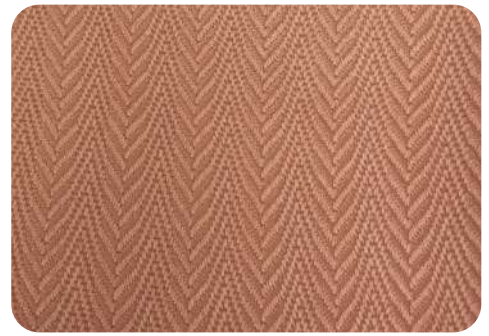
ALTO - 5018