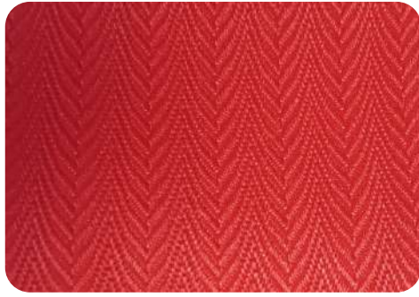
ALTO - 5101