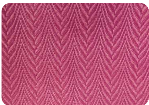
ALTO - 5105