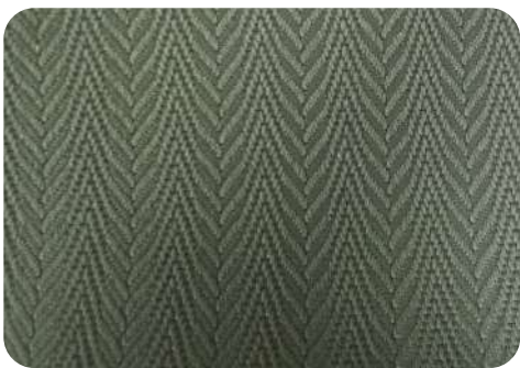
ALTO - 5054