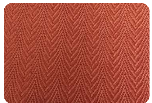
ALTO - 5109