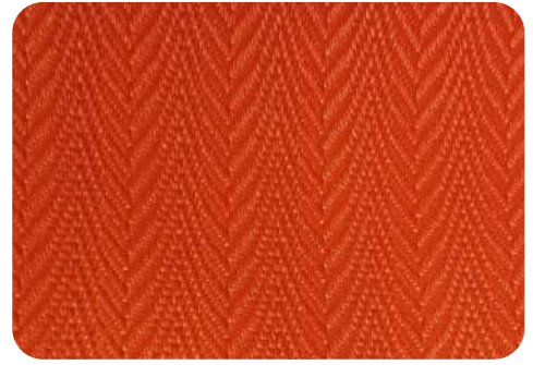
ALTO - 5044