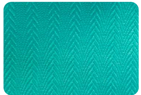
ALTO - 5113