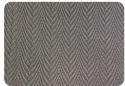
ALTO - 5106