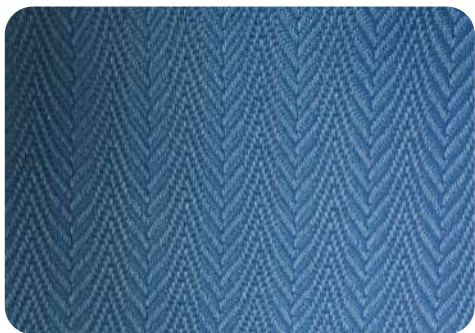
ALTO - 5016