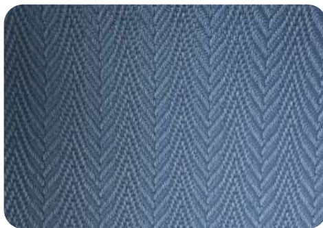
ALTO - 5007