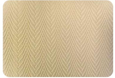
ALTO - 5009