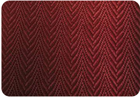
ALTO - 5020