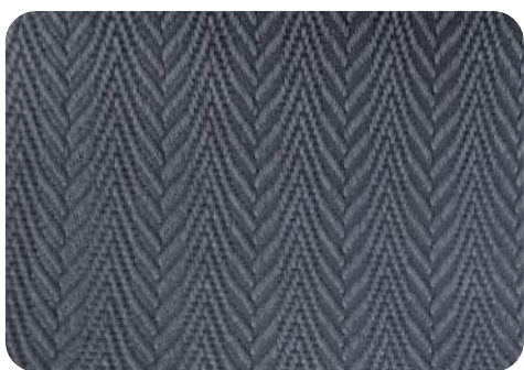
ALTO - 5031