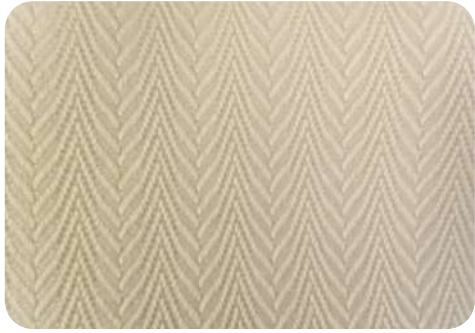
ALTO - 5107