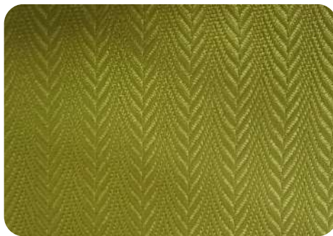
ALTO - 5114