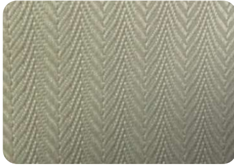
ALTO - 5111