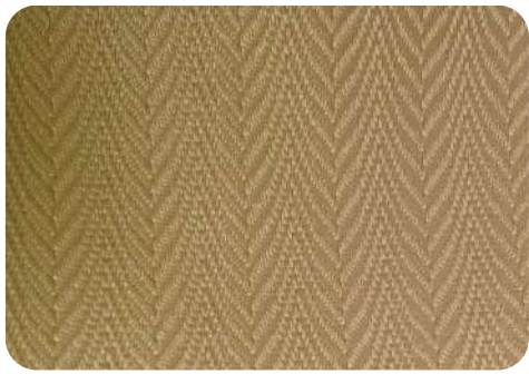
ALTO - 5030