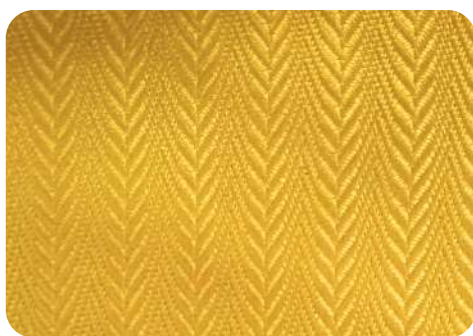
ALTO - 5108