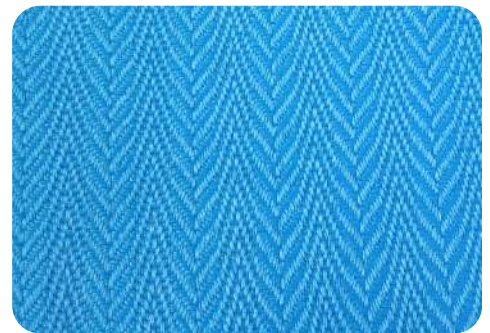
ALTO - 5104